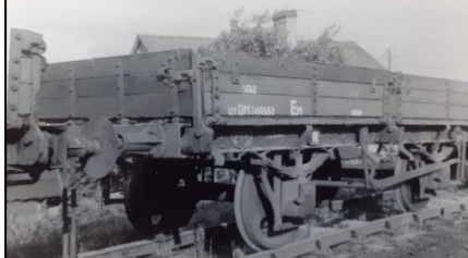
Wagons outside Greenfields Farm, Bradley